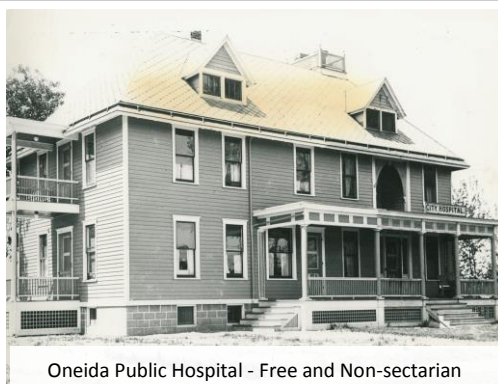
Oneida Public Hospital - Free and Non-sectarian Williams Street - 1899 - 1937